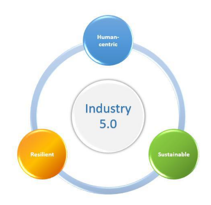
Figure 2. Industry 5.0.

A purely profit-driven approach has become increasingly untenable. In a globalised world, a narrow focus on profit fails to account correctly for environmental and societal costs and benefits. For industry to become the provider of true prosperity, the definition of its true purpose must include social, environmental and societal considerations. This includes responsible innovation, not only or primarily aimed at increasing cost-efficiency or maximising profit, but also at increasing prosperity for all involved: investors, workers, consumers, society, and the environment.