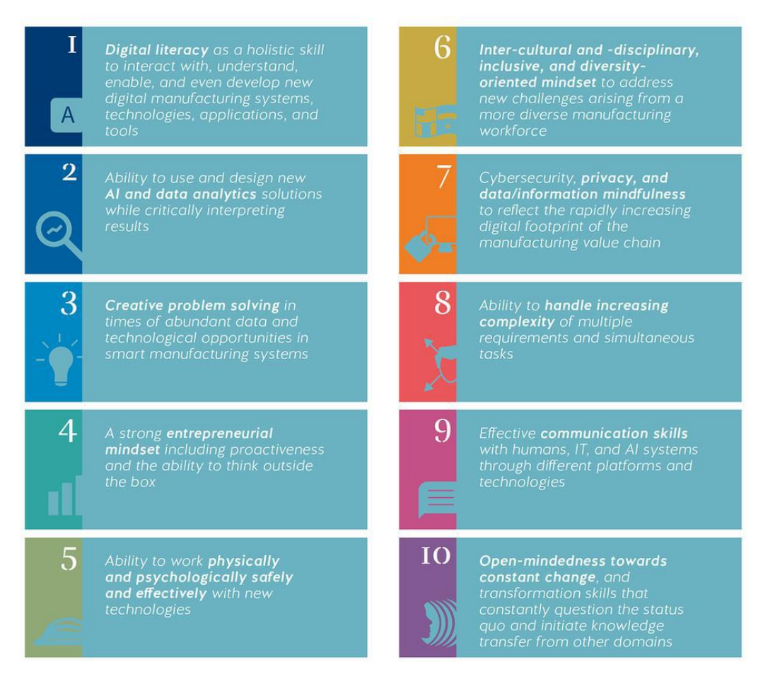
Figure 5. World Manufacturing Forum's op ten skills for the future of manufacturing

While research and innovation are key engines of productivity and competitiveness, economies and companies can also benefit by importing and adopting innovations produced elsewhere. The technology diffusion depends primarily on absorption capacity, which can be built via internal investment in skills and human capital. Companies could, and should, play a more important role in the education and training of the workforce as they have the expertise, knowledge and most direct link to technology. They know which skills are missing, and which will be required in the future. Workers should meanwhile be encouraged to participate in the design of trainings, to make sure trainings are relevant and adapted to their audience.