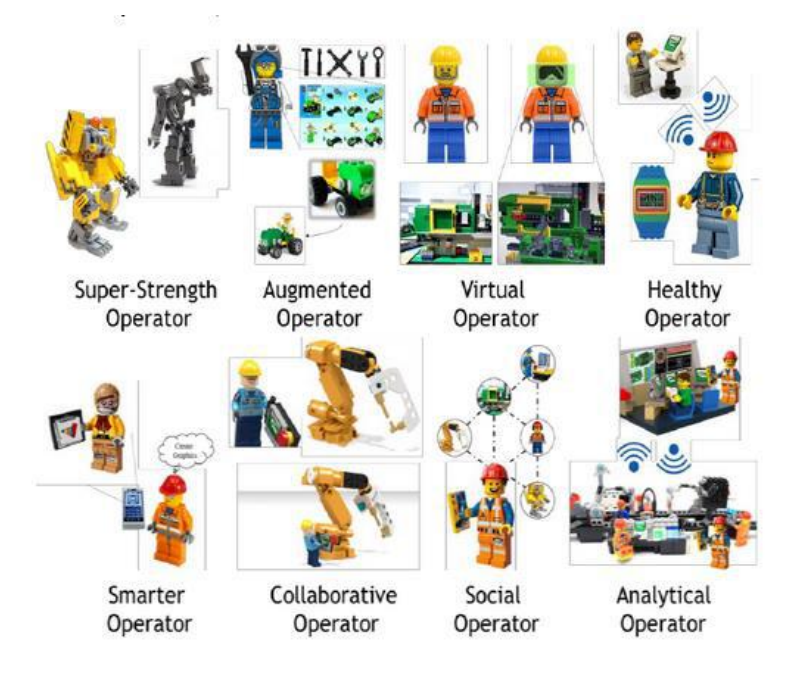
Figure 3. Operator 4.0 typology.

assistant), the Collaborative Operator (operator + collaborative robot), the Social Operator (operator + social networks), and the Analytical Operator (operator + Big Data analytics)<sup>xii</sup>. With this approach, humans remain at the centre of the production process, and technology maximises the benefits for both the company and the worker.